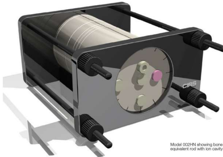
Model 002HN showing bone equivalent rod with ion cavity